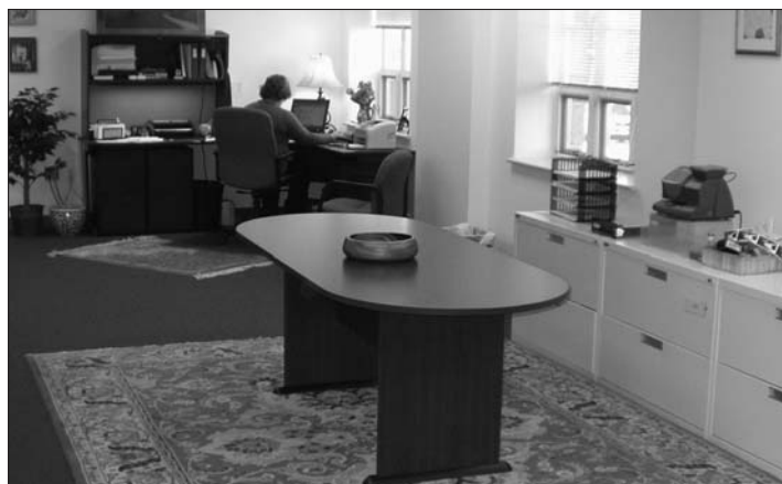
CLSA's new office space at Hecker Center will serve the Society for years to come.

One very important item about the move with which you can help us is our change of postal address and telephone/fax numbers. If you could ask your business office to update their computers with our new address as well as your own address books, this will facilitate communication between the Executive Coordinator's Office and our members. It is something of a mystery, but some mail continues to be forwarded to the old offices at Catholic University.