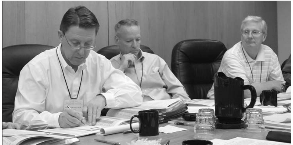
The Board of Governors met both before and after the convention.