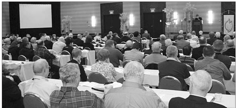
Three hundred participants gathered in Louisville for the 2009 CLSA Convention.